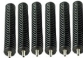
6 x 6” Rods