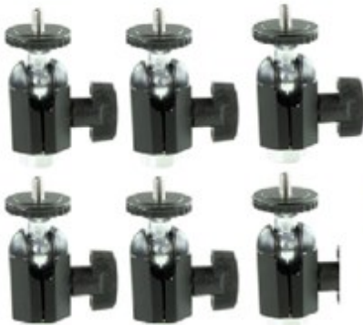
6 x 6 - Ball Tilt Heads