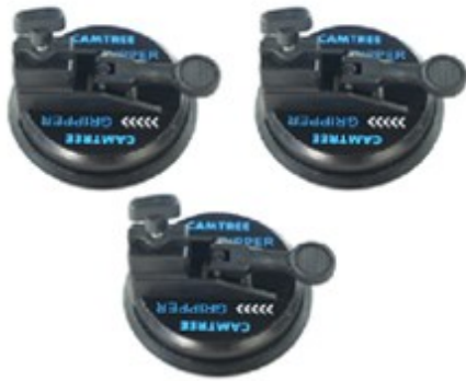
3 x Gripper Suction Cups

Please inspect the contents of your shipped package to ensure you have received all that is pictured and listed below.