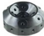
Camera Mount Hub