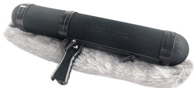
60cm Blimp windshield with microphone suspension and handle

Please inspect the contents of your shipped package to ensure you have received everything that is listed below.