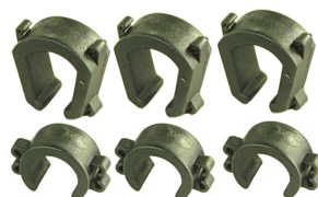
Bonus 6 pc. Boom Pole Adapter Set