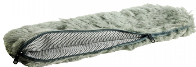
60cm Synthetic Fur Cover